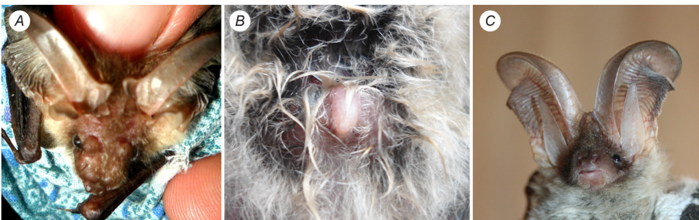
Fig. 1. Morphological details in Plecotus auritus from Luhansk region: (A) view of the head from above with a well-marked protuberance above the eyes (photo by S. Rebrov), (B) penis tapered continuously from the base towards the tip (photo by S. Rebrov); (C) bright tips of the tragus (photo by I. Zagorodniuk)

In total, 35 long-eared bats from 4 localities were contactly examined. The color of fur and tragus , morphology of protuberance above eyes, the thumb length, and morphology of glans penis in males unequivocally indicate that the examined specimens belong to the species of P. auritus sensu stricto . In particular, the color of fur on the back is brown, and the belly has a distinct yellow tinge. The length of the thumb was 6 mm or more, and the tops of the tragus were light. The protuberances above the eyes were larger than the eyes themselves (Fig. 1, A). The glans penis was narrow in all the studied males ( n = 14 ) (Fig. 1, B).