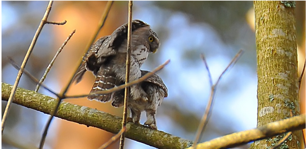
Fig. 3 Copulation of Eurasian Pygmy-owls

begins to vocalize: at this point, the female “hisses” in the hollow in response and flies out. The transfer of food takes place on a branch near the hollow and is accompanied by short, frequent sounds. The female plucks the birds in the hollow and throws the feathers out of the hole. Garbage accumulates under the nest hollow – prey feathers, pellets and egg shells.