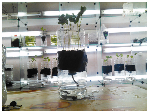
Fig. 1. Seedlings of Phaseolus vulgaris L. in microcosms on 14 th day after sowing

After determining the emission of gases in microcosms and morphometric parameters of seedlings, the concentration of organic carbon in aboveground dry weight of P. vulgaris was analyzed by the Tyurin method [14].