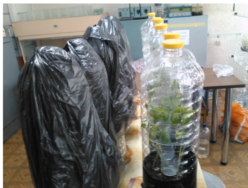
Fig. 2. Preparation of microcosms for measuring emission of gases

Рис. 1. Паростки Phaseolus vulgaris L. у мікрокосмах на 14-й день після посіву